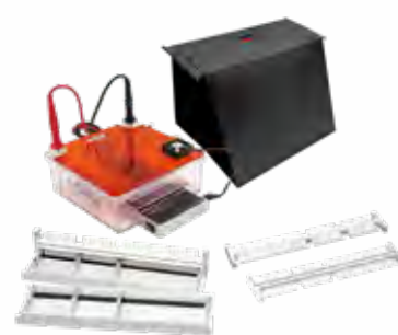
MBA-300 + MJ-105A