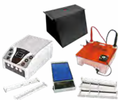
MBA-300 + MJ-105A + MINI-300