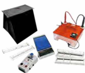
MBA-300 + MJ-105A + MP-100