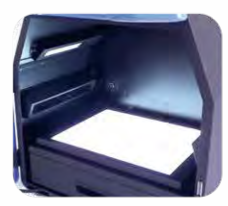
White Light Plate for protein analysis