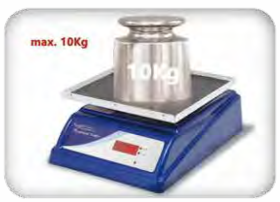
Heavy loading capacity

The MS Anti-moisture Shaker series offers the same capabilities as our original MS shaker series with moisture protection coating. The moisture protection allows you to operate the shaker in cold-room or low temperature environment. An anti-moisture coating is applied on the electrical structure to minimize and prevent the forming of condensation when operating in & out of the cold room. Standard features and accessories from the MS shaker series apply to all three different models.