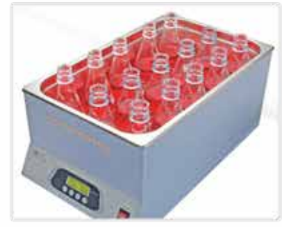
Max. chamber capability (no using stirring mixture function): 15 sets of 250ml flasks 8 sets of 500ml flasks

The size of different brand bottle may vary slightly. Please refer the following table as reference only.