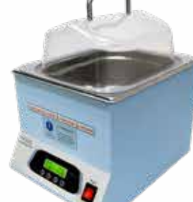
Built-in magnetic stirring mechanism