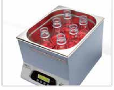
Max. chamber capability (no using stirring mixture function): 6 sets of 250ml flasks 4 sets of 500ml flasks